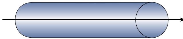
Path of a molecule through a leak path in laminar flow.